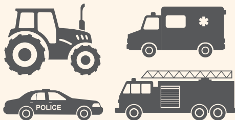
DIRECT NON-COMMERCIAL DELIVERIES

Businesses that either purchase fuel from refiners, bring it in via rail or vessel or purchase it on the spot market. Marketers then transport the fuel to be delivered to either (1) a gas station, (2) a gas station that the fuel marketer also owns, or (3) direct non-commercial deliveries.