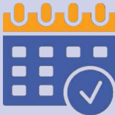
More Programs & Advocacy